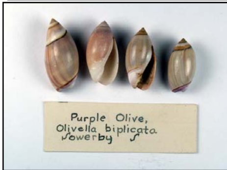
Purple Olive, Olivella biplicata Sowerby S