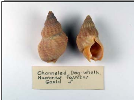
Channeled Dog-whelk, Nassarius fossatus Gould S