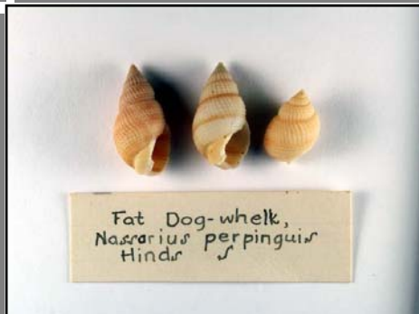
Fat Dog-whelk, Nassarius perpinguis Hinds S