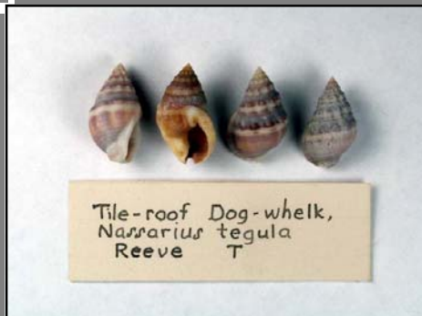
Tile-roof Dog-whelk, Nassarius tegula Reeve T