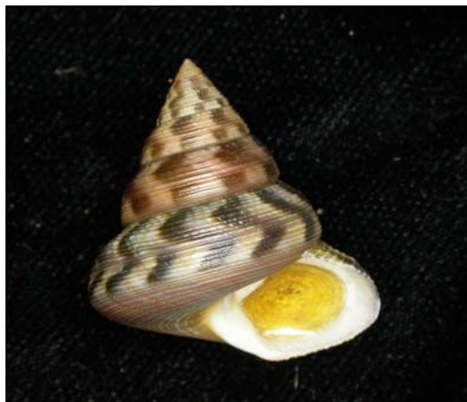
Calliostoma gloriosum Dall, 1871 For a picture of a live animal, turn to page 6.