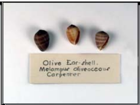
Olive Ear-shell, Melampus oliveaceus Carpenter