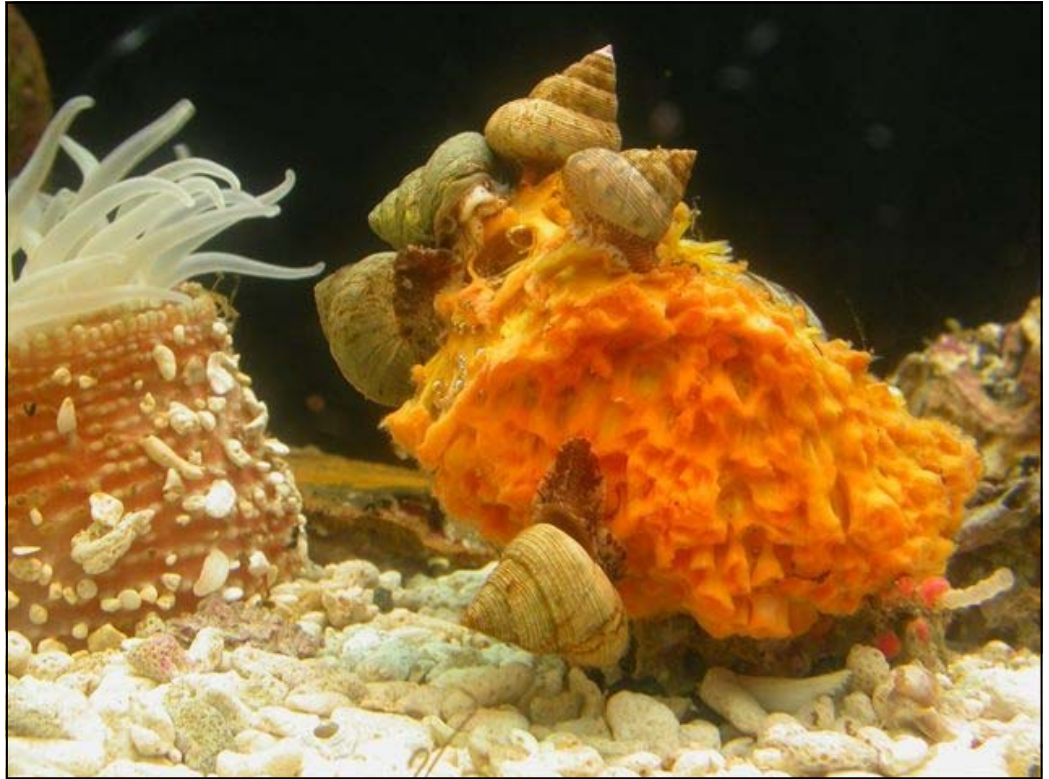
Calliostoma gloriosum Dall, 1871 Originally collected off of El Segundo, Los Angeles Co., California

For an additional photograph of the shell, turn back to page 1.