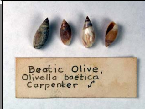
Baetic Olive, Olivella baetica Carpenter S