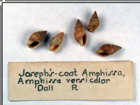
Joseph's-coat Amphissa, Amphissa verrucolor Dall R