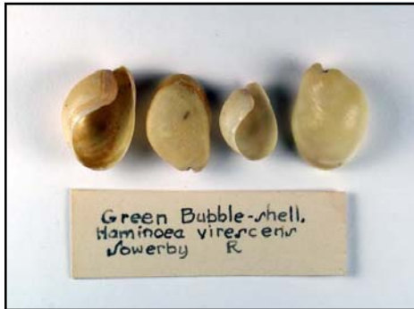
Green Bubble-shell, Haminoea virecens Sowerby R