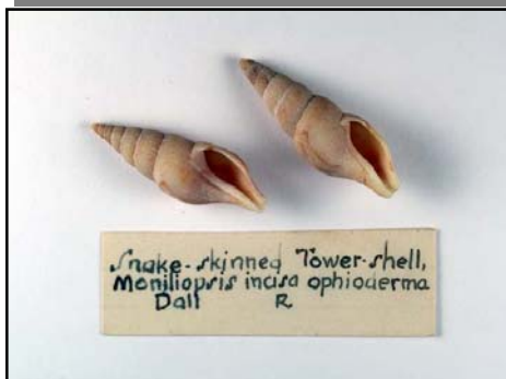
Snake-skinned Tower-shell, Mentleopsis incisa ophiocarpa Dall R