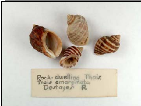
Rock-dwelling Thair, Thais emarginata Deshayes R