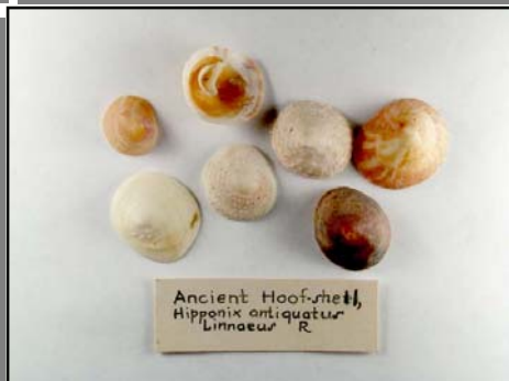
Ancient Hoof-shell, Hipponix antiquatus Linnaeus R