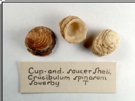
Cup-and-saucer Shell, Crucibulum spinorum Sowerby T