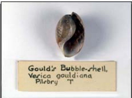
Gould's Bubble-shell, Verica gouldiana Pilsbry T